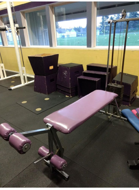
(#4) Leg extension/ hamstring curl machine . Manufactured in the 80's. Donated to FHHS in the early 2000's.