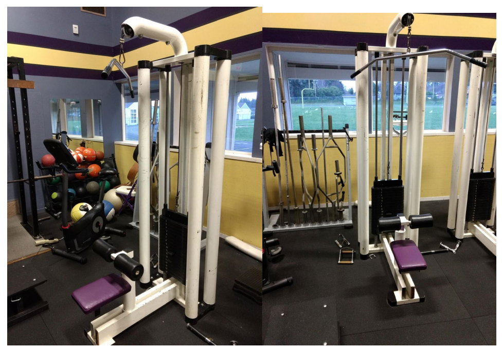
(#1) Cable pull down machine . Manufactured in the 80's. Donated to FHHS in the early 2000's. (Accessories not included).