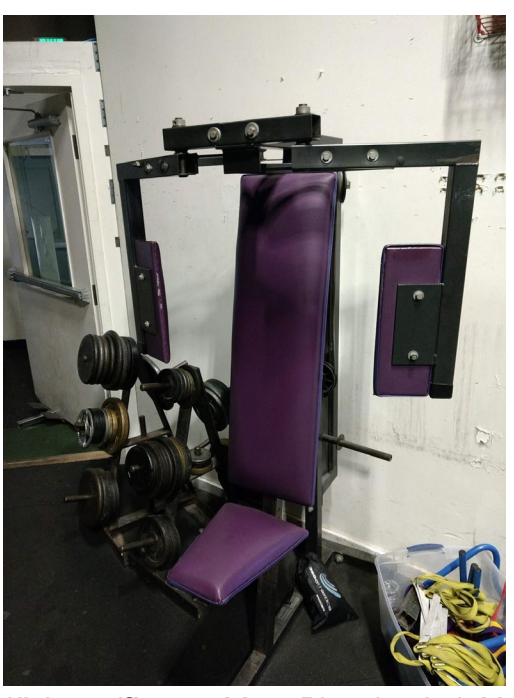
(#5) pec/fly machine. Plate loaded. Manufactured in the 80's. Donated to FHHS in the early 2000's