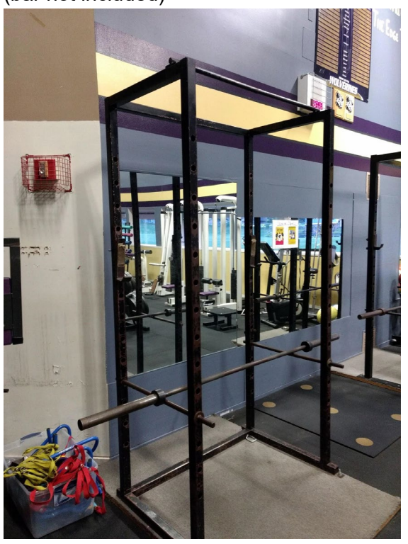
(#8) Squat rack/half cage. Manufactured in the 90's. Used at FHHS since early 2000's. (bar not included)