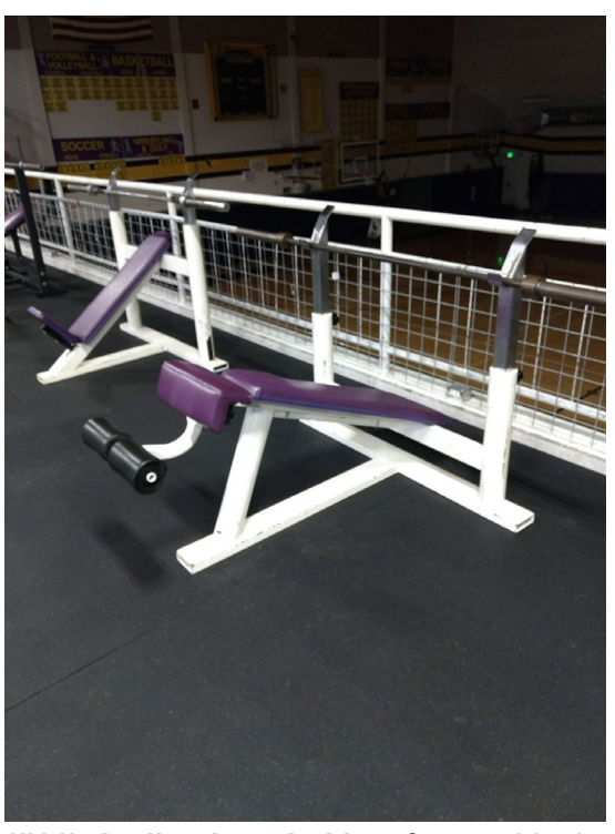
(#11) decline bench. Manufactured in the 80's. Donated to FHHS in the early 2000's (bar not included)