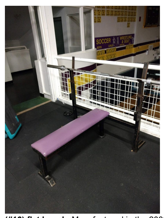
(#16) flat bench. Manufactured in the 2000's. (bar not included)