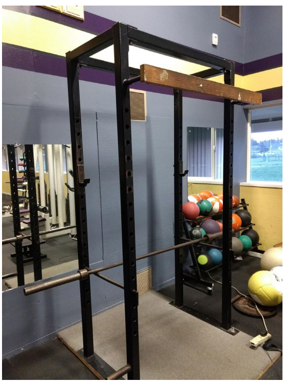
(#7) Squat rack/half cage. Manufactured in the 90's. Used at FHHS since early 2000's. (bar not included)