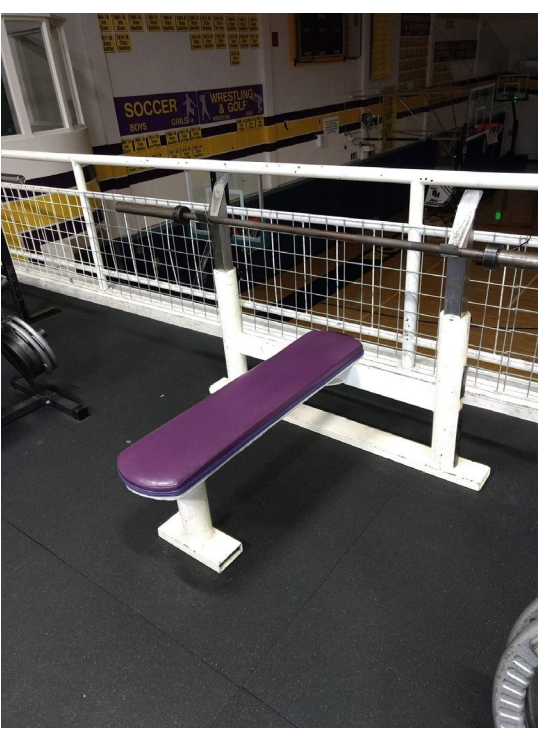
(#15) flat bench. Manufactured in the 80's. Donated to FHHS in the early 2000's (bar not included)