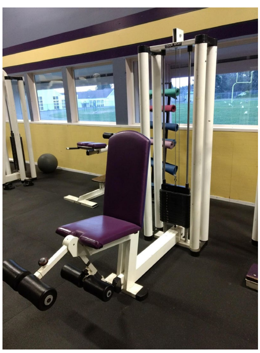
(#3) Leg extension/ hamstring curl machine. Manufactured in the 80's. Donated to FHHS in the early 2000's.