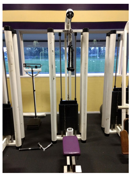
(#2) Cable pull down machine. Manufactured in the 80's. Donated to FHHS in the early 2000's. Missing leg/knee stabilizer. (Accessories not included).