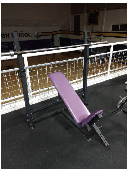
(#13) incline bench. Manufactured in the 2000's. (bar not included)