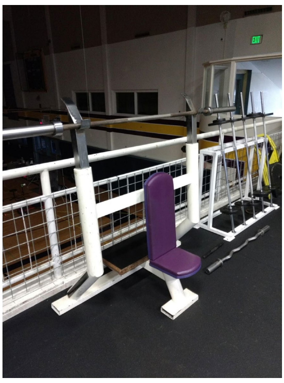
(#9) Shoulder press bench . Manufactured in the 80's. Donated to FHHS in the early 2000's (bar not included)