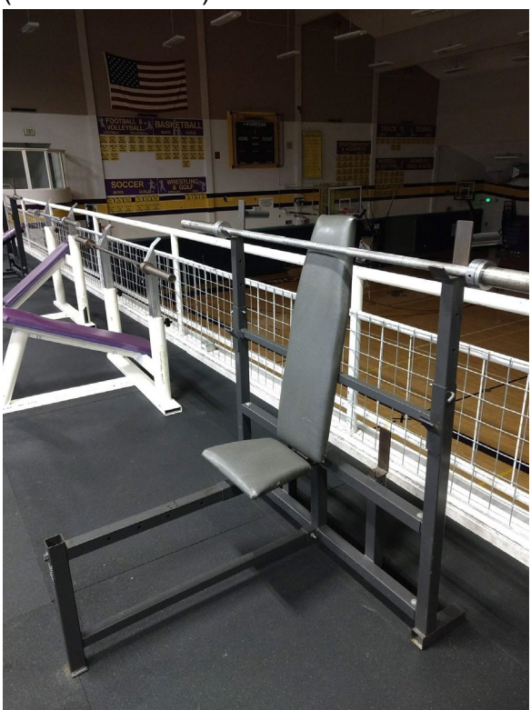
(#10) adjustable bench. Manufactured in the early 2000's (bar not included)