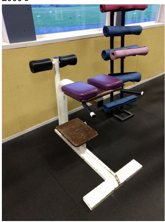
(#6) back extension/dip machine. Manufactured in the 80's. Donated to FHHS in the early 2000's