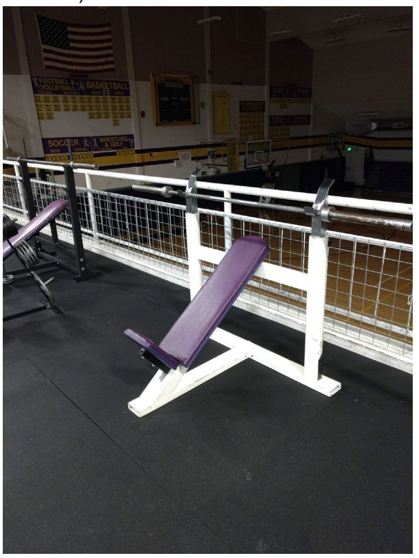
(#12) Incline bench. Manufactured in the 80's. Donated to FHHS in the early 2000's (bar not included)